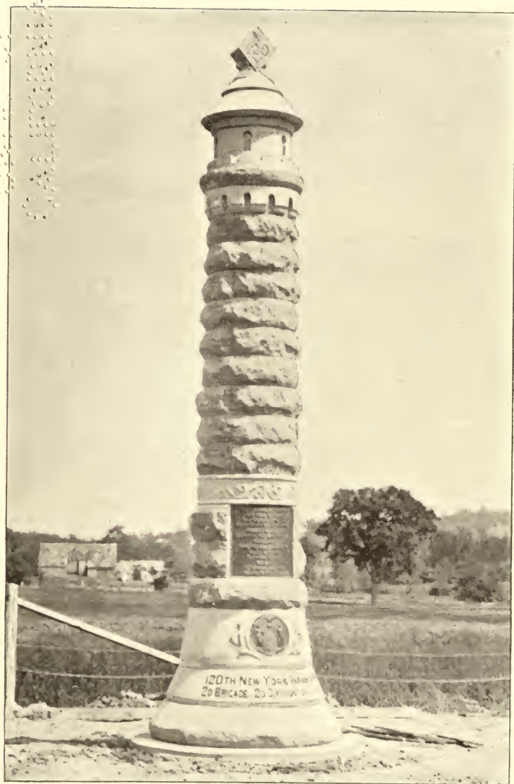
BATTLE MONUMENT AT GETTYSBURG.